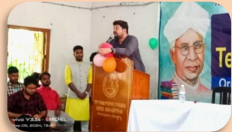
Teachers' day Celebration