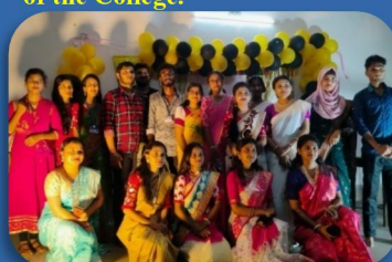
Teachers' Day Celebration, Dept. of English