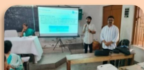
Career Counselling Seminar