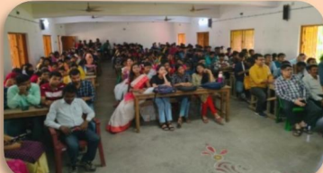
Teachers' day Celebration