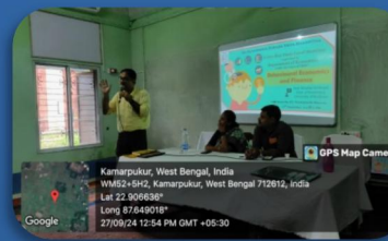
State Level Seminar, Dept. of Economics