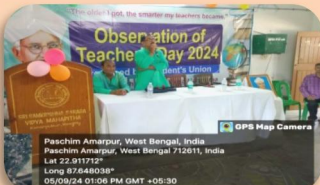
Observation of Teachers' Day