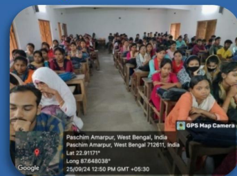
Career Counselling Seminar