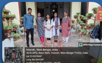
Participants of quiz competition at RKMV