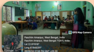
Teachers' Day Celebration, Dept. of Geography