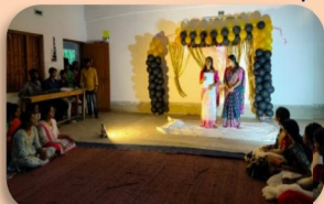
Teachers' Day Celebration of Dept. of English